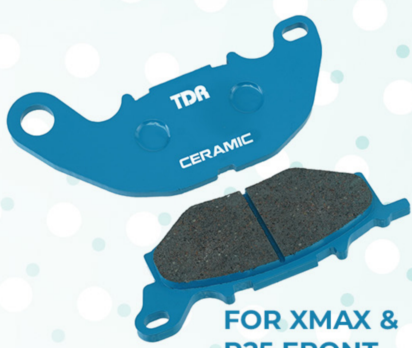
FOR XMAX & R25 FRONT HET: RP. 250.000

Reduce dust generation & keep your wheel cleaner