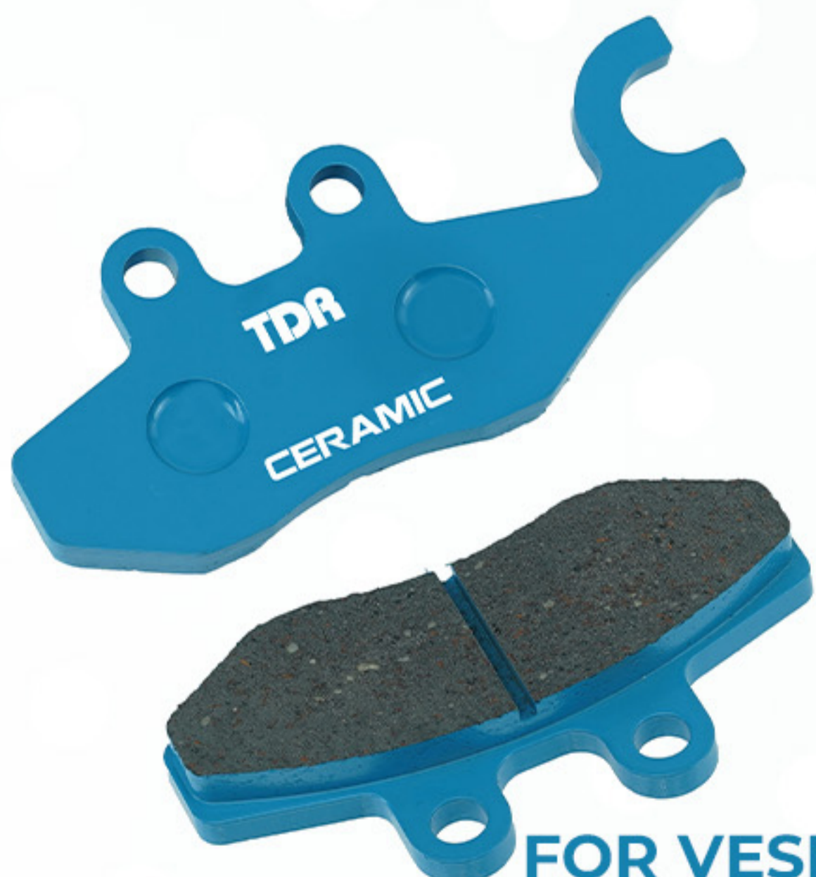
FOR VESPA SPRINT 150 & PRIMAVERA HET: RP. 220.000