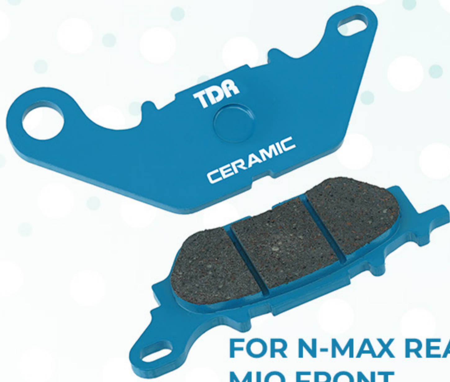
FOR N-MAX REAR & MIO FRONT HET: RP. 200.000