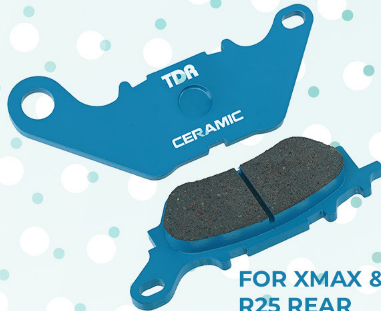
FOR XMAX & R25 REAR HET: RP. 250.000