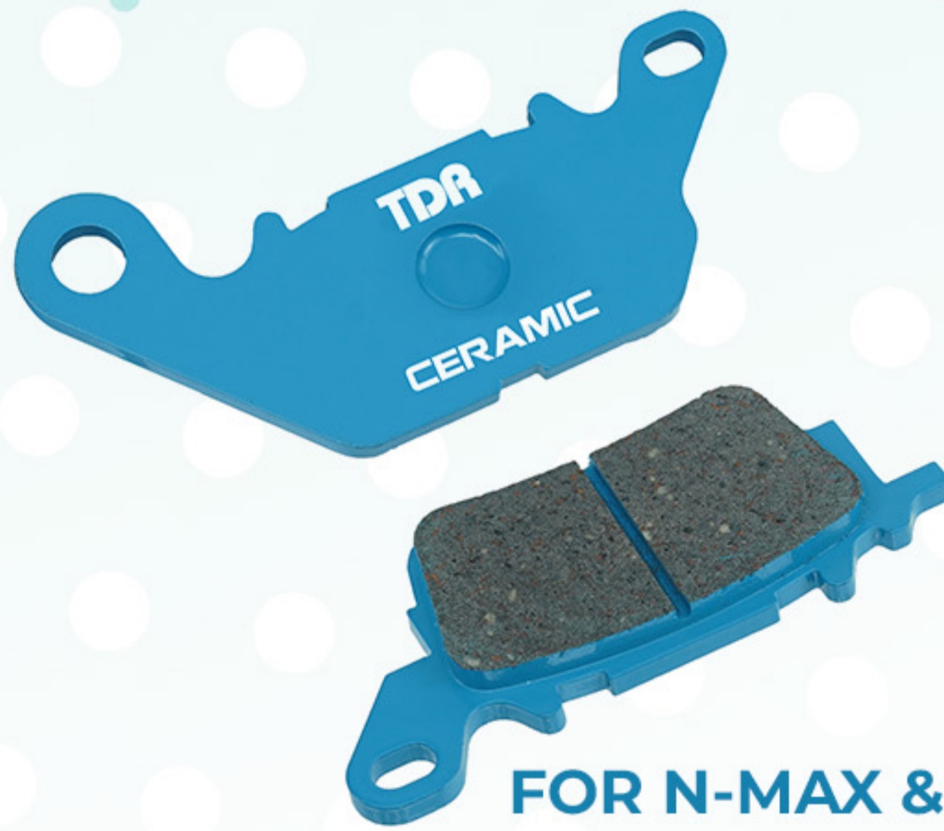
FOR N-MAX & AEROX FRONT HET: RP. 200.000